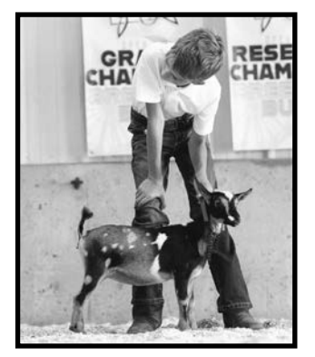
JULY 19-27, 2024

Overall Champion & Reserve Selection......$200/100