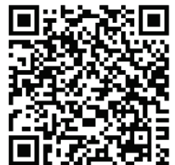
Pump & Fill