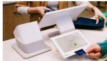
Clover Due Station

I want to RENT _____ (quantity) Clover Mini LTE for $121.90 per check-out window (includes two Mini Clover devices with forward facing display, tether cable, no cash drawer)