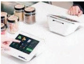
Clover Mini tethered to Clover Mini