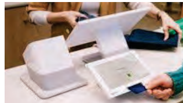
Clover Due Station

I want to RENT _____ (quantity) Clover Mini LTE for $121.90 per check-out window (includes two Mini Clover devices with forward facing display, tether cable, no cash drawer)