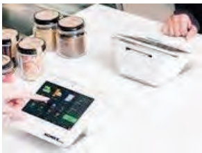
Clover Mini tethered to Clover Mini