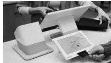
Clover Due Station

I want to RENT _____ (quantity) Clover Mini LTE for 140.00 per check-out window (includes two Mini Clover devices with forward facing display, tether cable, no cash drawer)