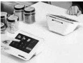
Clover Mini tethered to Clover Mini

CLOVER GO DEVICES AND VIRTUAL TERMINALS ARE NOT PERMITTED