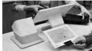
Clover Due Station

I want to RENT _____ (quantity) Clover Mini LTE for 140.00 per check-out window (includes two Mini Clover devices with forward facing display, tether cable, no cash drawer)