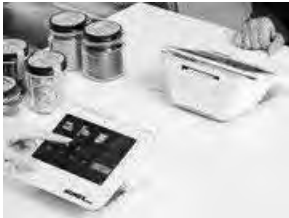
Clover Mini tethered to Clover Mini